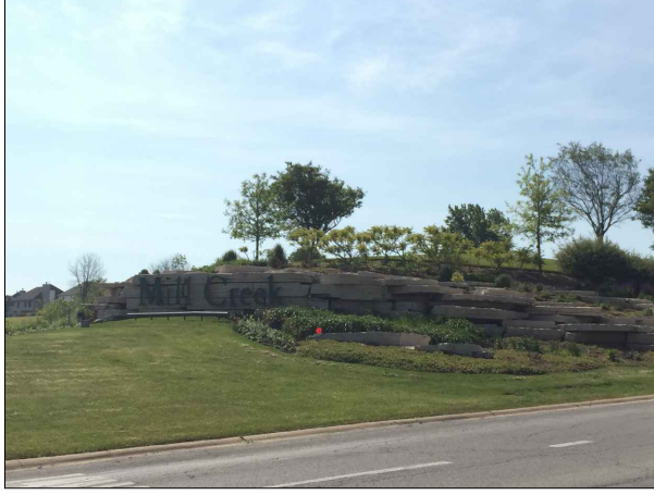
MILL CREEK (2 OF 2 SIGNS) 4' TALL, 70' LONG 300' SFT APPROX.