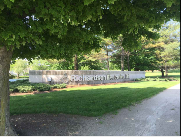
RICHARDSON ELECTRONICS SIGN (1 OF 2 SIMILAR SIGNS) 5' TALL, 70' LONG 350 SFT APPROX.

MA CENTER - COMPARATIVE STUDY OF NEIGHBORHOOD SIGNS MAY 25, 2016 PAGE 3 OF 3